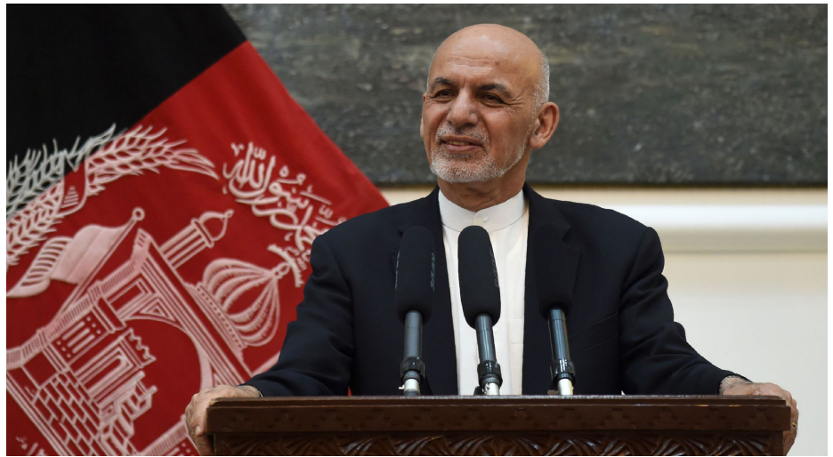
Ghani flies the coop! He heard the Taliban was in the building. They weren't. But he was gone.

The defeat of the U.S. project in Afghanistan is proof of the decline of U.S.