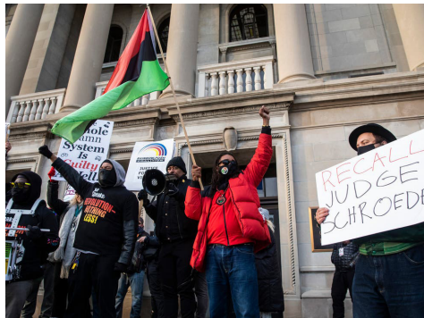
Kenosha