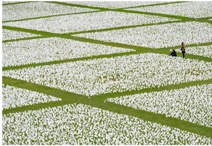
700,000 white flags on the national mall: the capitalist class surrenders our lives to Covid

The right wing nut echo chamber COVID Deniers and enemies of public education, Trumpites and Charter School anti-union hacks promote the virtues of opening up science to "alternative" facts in August