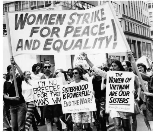
Women's Strike for Peace and Equality, New York City, Aug. 26, 1970.

Almost at once, beginning in 1973, the right wing started pushing back and chipped away at the gains of women for years until quantitative erosion became qualitative obliteration. Texas is now reaction's template. We should say 'for the moment.' The Administration