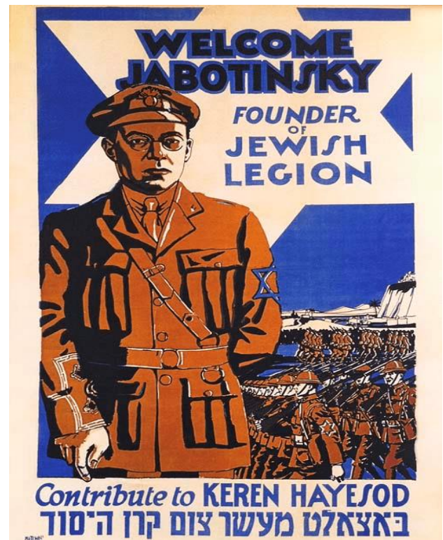
1930 United Israel Appeal Poster

some said they were); they identified as working class fighters for socialist universalism. They rejected Zionist supra-class national unity (Klal Yisrael) and emigration