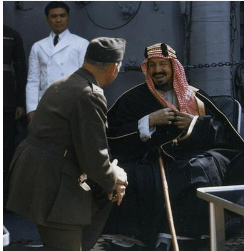
King Abdul Aziz Ibn Saud of Saudi Arabia with Franklin D. Roosevelt on the USS Quincy Egypt February 14, 1945

President Roosevelt 'replied that he wished to assure his Majesty that he would do nothing to assist the Jews against the Arabs', and would and would make no move hostile to the Arab people.'... "Roosevelt's remark ignited a firestorm of criticism in the American Jewish community. "One wonders why Arab [leaders] were consulted about the fate of the Jewish National Home," the American Zionist leader Dr. Abba Hillel Silver complained. "Were the Jewish people consulted about the fate of Iraq, or Syria, or Saudi Arabia."