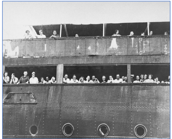
The St. Louis Jewish Refugees turned away at the port of Miami 1939

Stalin's support for Israel, which seems to be a complete secret from the ranks of today's neo-Stalinists, was derived in part from his own anti-Semitism and in part from a desire to make difficulties for the UK at a time when it was preoccupied with its troubles in India. Thus we saw Pete Seeger sing songs popularizing the life of the kibbutzim. Most Americans do not know about the rotten immigration position of the USA, the 1924 Immigration Law quotas and how they did not let Jews escape to the USA. Even the British did better than the U.S. did. Bourgeois support for Zionism in the later 1940's hid the truth of the Ku Klux inspiration of the immigration quotas, corresponding to then-trendy concepts of race and eugenics among the U.S. ruling class of the pre-Civil Rights movement era. Hardly any one talks about the St. Louis , the ship which no one let dock to let off the fleeing German Jews.