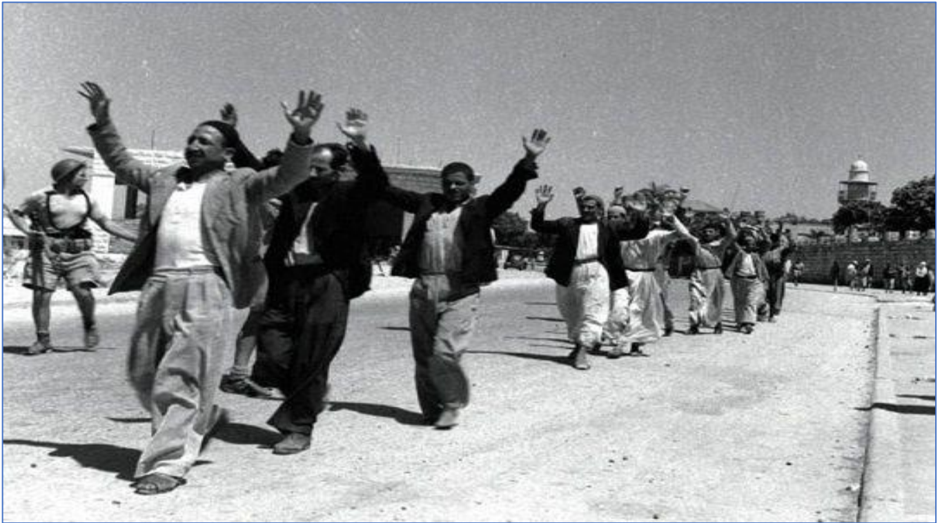
Palestinian residents of the town of Ramle raise their hands in surrender to Israeli soldiers on July 11, 1948.